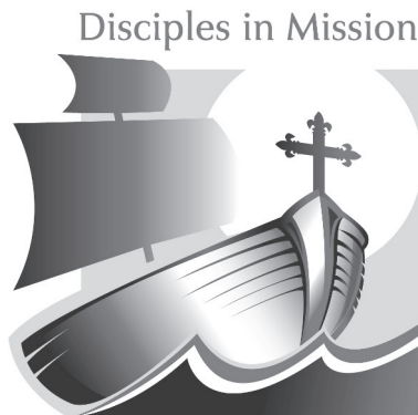
Archdiocese of Boston

Mary's Parish best be able to participate in the formation process of being a collaborative parish?" although St. Mary's will not be joined with any other parish: it will be a ("stand alone Collaborative"). Our Parish Pastoral Council and I answered: "Year Three". In the last days of