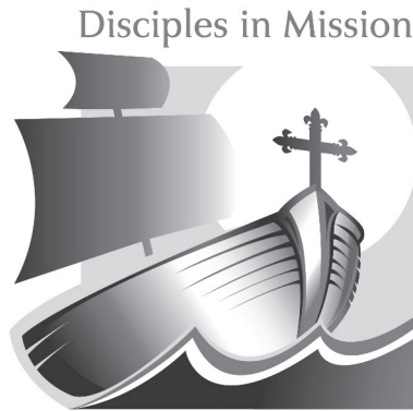
Archdiocese of Boston

Many years ago the late Pope, Saint John Paul challenged all of us “to put out into the deep” concerning our faith in Jesus Christ. What a wonderful image for us to envision and reflect upon as we try to live our faith in our Parish of Saint Mary. Cardinal Sean also challenged each one of us a few years ago to become a “Disciple in Mission” for the Lord Jesus. Each one of us is to be a person who actively and consciously walks with the Lord and helps each other along the way. We are to witness in faith each day to our spiritual identity and person, to our hopes and dreams and to our beliefs. Our Cardinal’s powerful challenge is an invitation for each parish of the Archdiocese to re-image, re-shape and re-envision the faith community so that it may be a great center of belief, worship and service. I would suggest that “putting out into the deep” is what captures my mind and heart at this time.